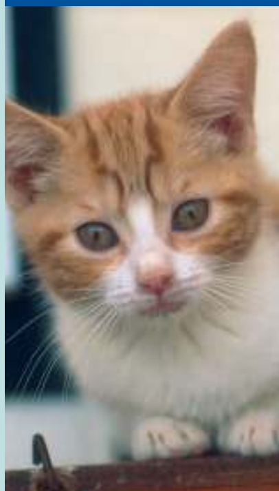
BELOW: Kitten in an RSPCA animal centre