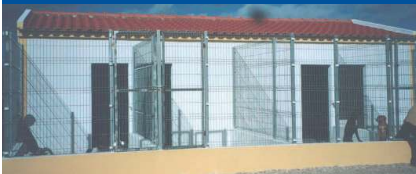
Kennel block at Java animal shelter, Portugal

By providing sufficient space, proper facilities and appropriate company of the animals' own kind.