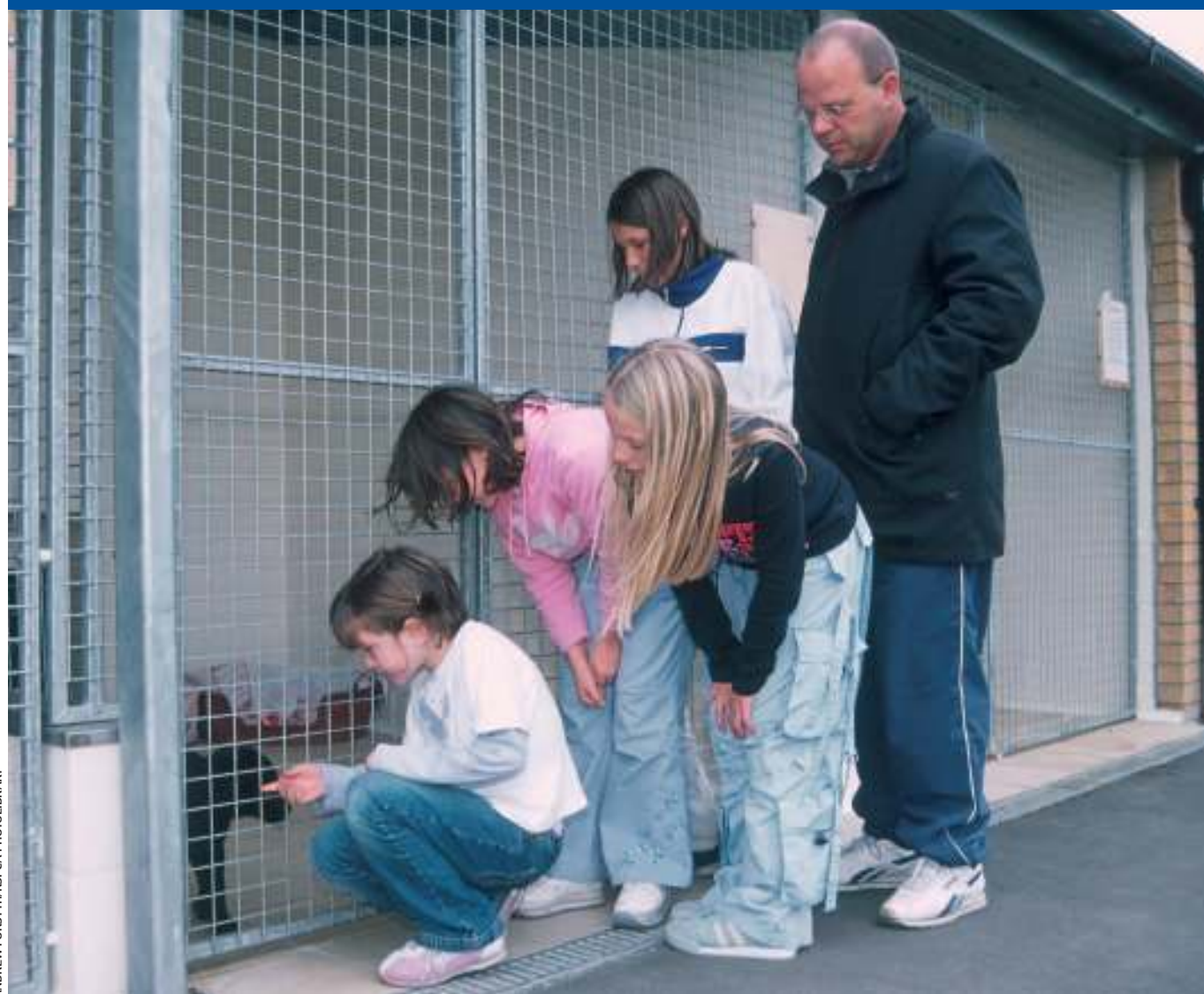
Family looking at a dog waiting to be rehomed at an animal centre

Your organisation will need to weigh up the actual cost of implementing the policy, against the perceived benefit.