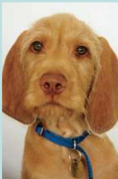
ABOVE: Hungarian wire-haired vizsla