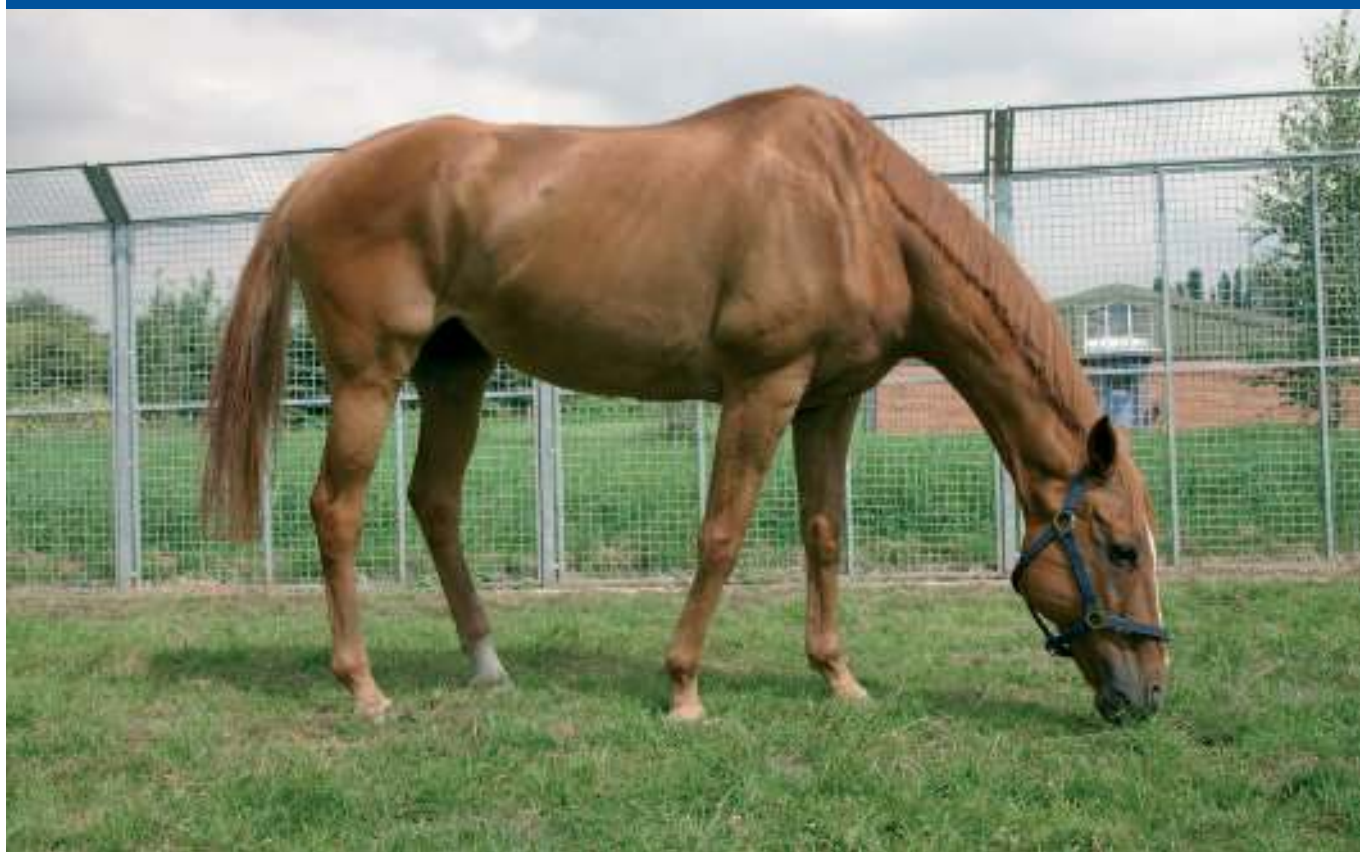
Horse in an RSPCA animal centre

The small animals block will need to be equipped with appropriate food and equipment, e.g. cages.