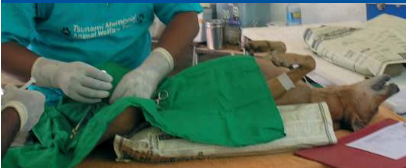
Neutering policy being put into practice in Sri Lanka

This option is more expensive than neutering males, however, the benefits are that it reduces the risk of pyometra (infection of the uterus) and may improve chances to rehome as the female will not come into season.