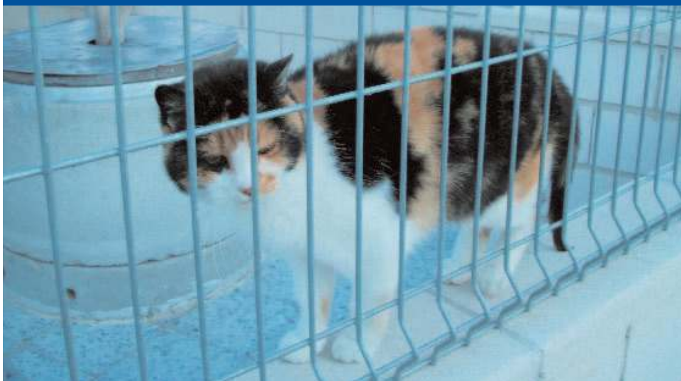
Cattery at an animal shelter in Madrid

Refer to the appendix for examples of these forms.